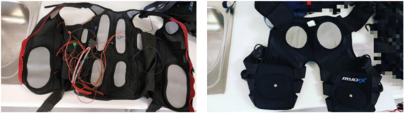
Figure 1. Electromyostimulation vest and shorts

Position of electrodes in electromyostimulation device stimulation body parts (trapezius, pectoral muscle, rectus abdominis, latissimus dorsi, erector spinae, gluteus maximus, quadriceps, biceps femoris).