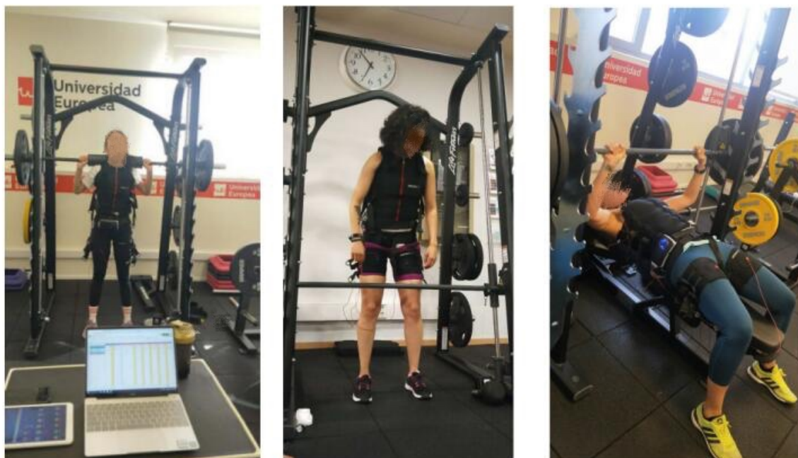
Figure 2 Training in different movement

performed as much repetitions as they could until bar displacement velocity dropped 10% from the maximum velocity monitored at the beginning of each set. We recorded the number of repetitions, the maximum velocity and stopping velocity. Participants rested 90 seconds between sets. WB-EMS stimuli was set as follows: current frequency was set at 85Hz, current pulse was set at 350 \mu s, and the wave pulse type was bipolar rectangular. Impulse intensity was individually set according to personal tolerance threshold, ranging from 60 to 100% of the device capacity.