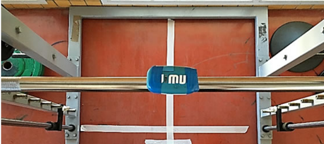
Figure 1. Inertial device location before and during the execution of the exercise.

Subjects went only once to the lab where they were performed 4 series of 10 repetitions of half squat exercise on the Smith machine (Technogym, Cesena, Italy) until 90° flexure with a complete stop, in order to suppress the possibility of rebound and improve the reliability (Pallarés et al., 2014). The intensity was of 65% of the first 1RM and the 60% of the “level of effort”. For the supplementary weight calibrated discs of 2.5, 5, 10 and 20 kg (Salter, Barcelona, Spain) were used. During experimental trials, MPV was continuously monitored by a WIMU PROTM inertial device with a 1000Hz sampling frequency. The inertial device was fixed on the center of the bar using adhesive tape (Figure 1) to avoid the influence of noise produced by the guiderails on the data measurement.