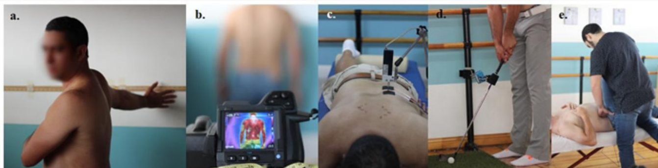
Figure 2. Assessments and intervention images. (a) Trunk Rotational Mobility Test (b) Back Skin temperature. (c). Time of Contraction. (d). Maximal Voluntary Isometric Strength. (e). e.g. Osteopathic Manipulation Techniques.